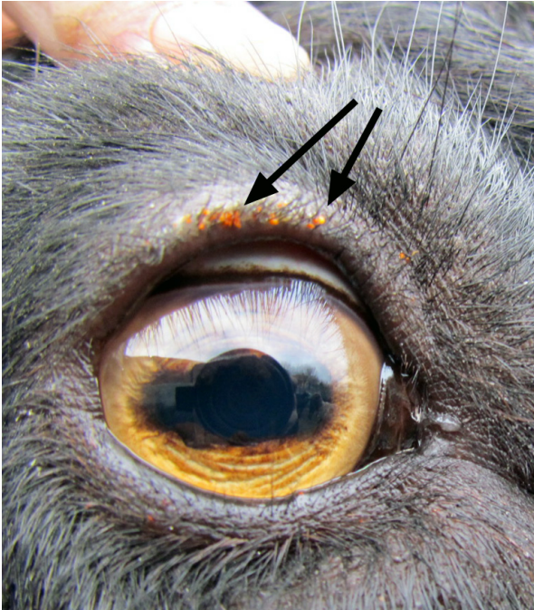
FIGURE 1: Neotrombicula heptneri attached around the eye of a goat.

Additionally, chiggers were observed in the posterior fossa of hind leg pastern of 12 animals, and on both front and hind legs of 4 animals (4-10 mites per animal).