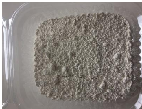
Figure 4. Calcite.

Calcite; chemical formula \text{CaCO}_3 , is a mineral which is the constituent of limestone which has a crystal grain size between 1 mm-100 mm. According to the Mohs hardness scale, its hardness is 3, and its specific gravity is 2.7 \text{ g/cm}^3 at 20^\circ\text{C} [9].