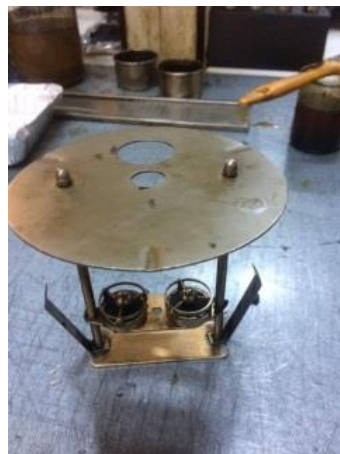
Figure 8. Ring-ball mechanism.

In order to measure the degree of the softening, a Ring-ball mechanism was installed with 2 pieces of balls with the weight of 3.5 grams (Figure 8). It was subjected to a heating test in a glycerine bath. The temperature was noted at the exact time the balls fell down and its softening degree was recorded.