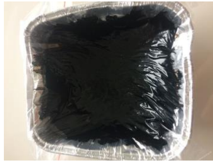
Figure 1. Bitumen.

The bitumen is defined as a viscous liquid or a solid substance which contains mainly hydrocarbons and its derivatives; it is soluble in trichloroethylene, non-volatile and gradually softening when heated [6].