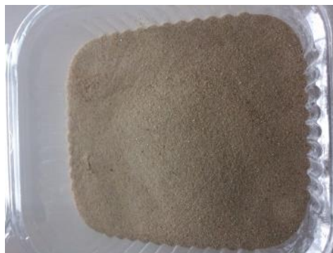
Figure 5. Silica Sand

Silica sand belongs under the group named insulated lightweight building materials. Silica sand is composed of silica particles smaller than 2 mm that are formed as a result of the separation of granite-type rocks. Although the average surface area varies depending on the region that it is extracted, it is about between 100\text{-}200 \text{ m}^2/\text{g} . It is used in the refractory industry, silica brick production, casting industry and glass industry [10]. The results of the analysis of silica sand are given in Table 1.