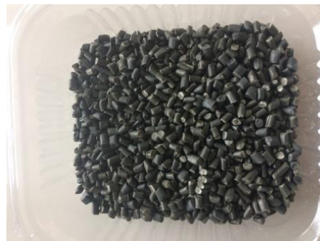
Figure 2. Isotactic Polypropylene.

Polypropylene, specifically isotactic polypropylene (IPP), the most common commercial thermoplastic polymer, has a significant power: weight ratio due to its low density and high endurance. Polypropylene crystals have a melting point of about 160°C and are usually processed over 200°C [7].