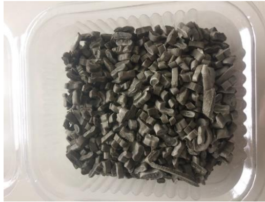
Figure 3. Low-density polyethylene.