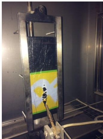
Figure 9. Fire testing device.

The samples that were prepared at 90 mm x 250 mm x 3 mm were tested with an E-class fire testing device (Figure 9).