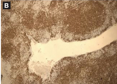
Figure 3. A: On microscopic analysis, reactive follicles with large germinal centers are seen beneath the epithelium (H&E, original magnification ×40). B: The reactive follicles are mostly made up of CD20-positive B cells (CD20, original magnification ×40).

tion, lingual tonsil hyperplasia may aggravate sleep disturbances. Before instituting any treatment for presumed lingual tonsil hyperplasia, it is important to perform a differential diagnosis to rule out cancer and specific granulomatous disorders such as tuberculosis.<sup>5</sup>