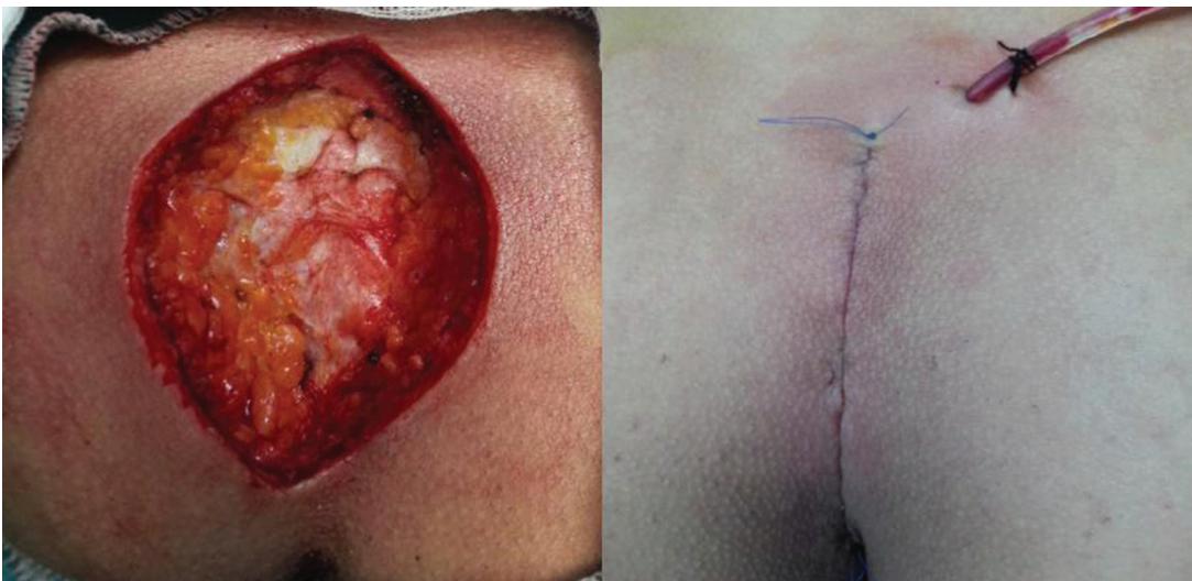
Figure 3 - Karydakis flap rotation.

3. Patient presenting with different conditions mimicking pilonidal sinus.