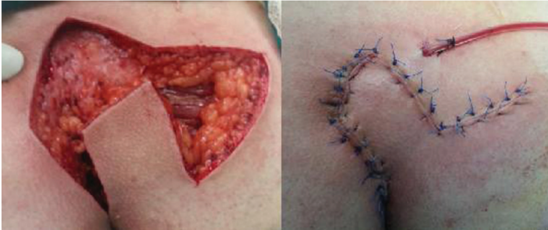
Figure 2 - Limberg flap technique.