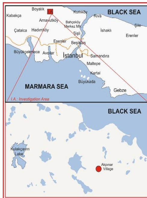
Figure 1. Location Map of Study Area (5).

The study area is Kulakçayiri lake, which is located in the Arnavutköy district in Istanbul and covers approximately 500 hectares (4). Kulakçayiri lake, which is considered to be one of the great lakes of the Marmara region in the past, is a shallow lake; it used to be possible to picnic and fish along its borders, but it is now dried up. The 3rd Airport Project plans to occupy the current site of the Lake. The location map of the study area is shown in Figure 1.