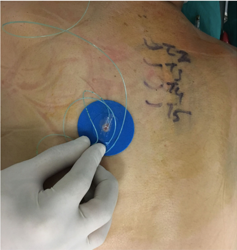
Fig. 3 The secured catheter with the instant skin adherence apparatus