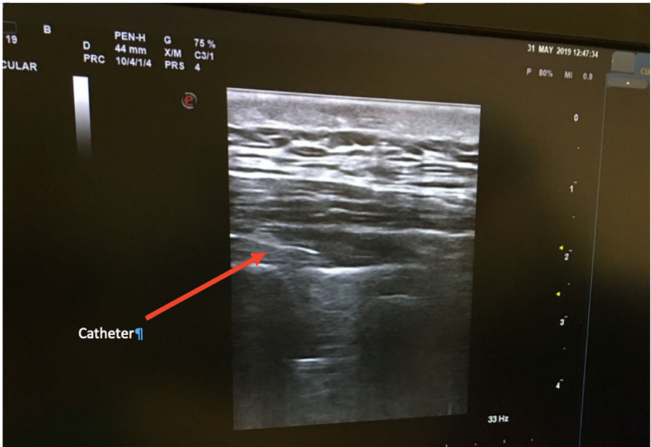
Fig. 2 Advancing of catheter in the erector spinae plane