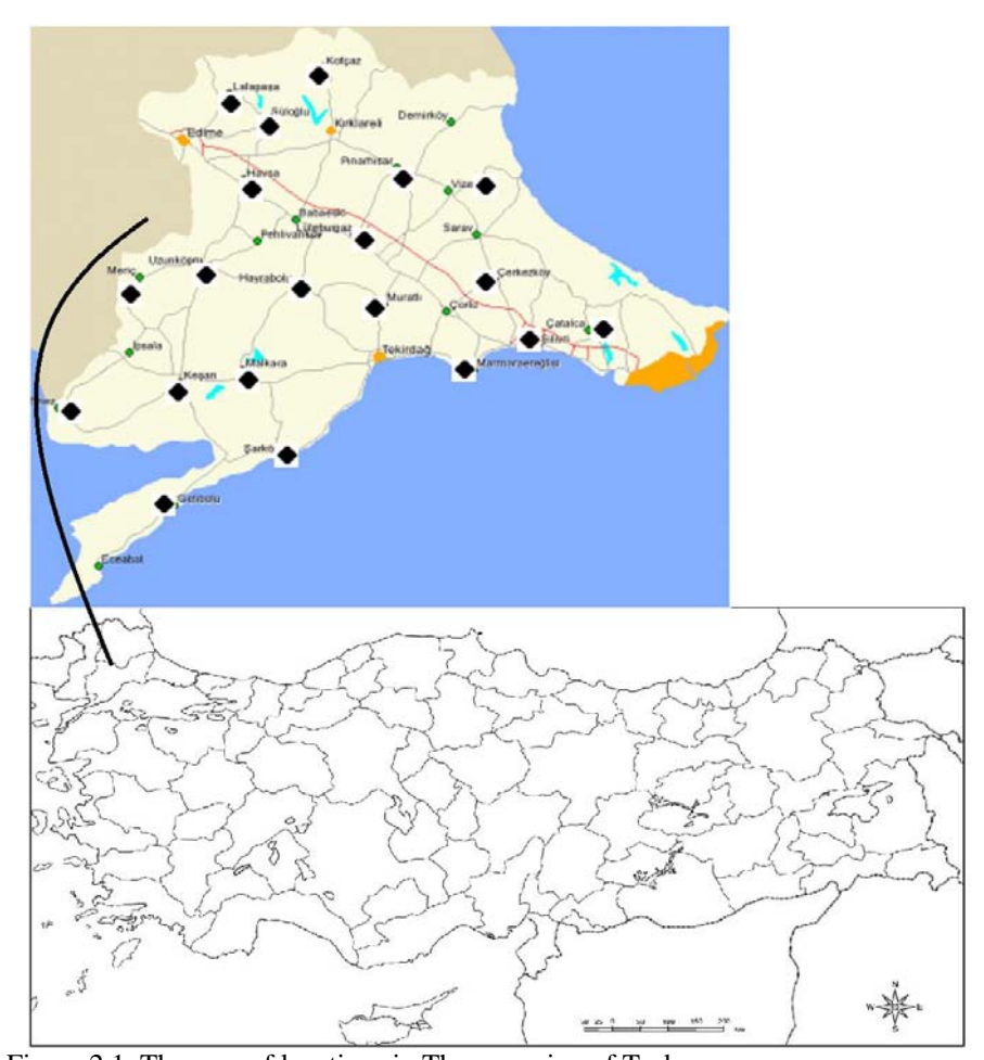
Figure 2.1. The map of locations in Thrace region of Turkey

The locations were determined based on differences in geographical structures with variable ecological conditions (Figure 2.1.). Plant samples were taken from 20 different points from areas away from residential areas (two in İstanbul, six in Tekirdağ, four in Kırklareli, seven in Edirne and one in Çanakkale) on 6-7 May 2013. The collection days had clear and sunny weather, the temperatures ranged between 17.2°C to 21.5°C. The altitudes of sampling locations varied from 6 - 518 m (Table 2.1).