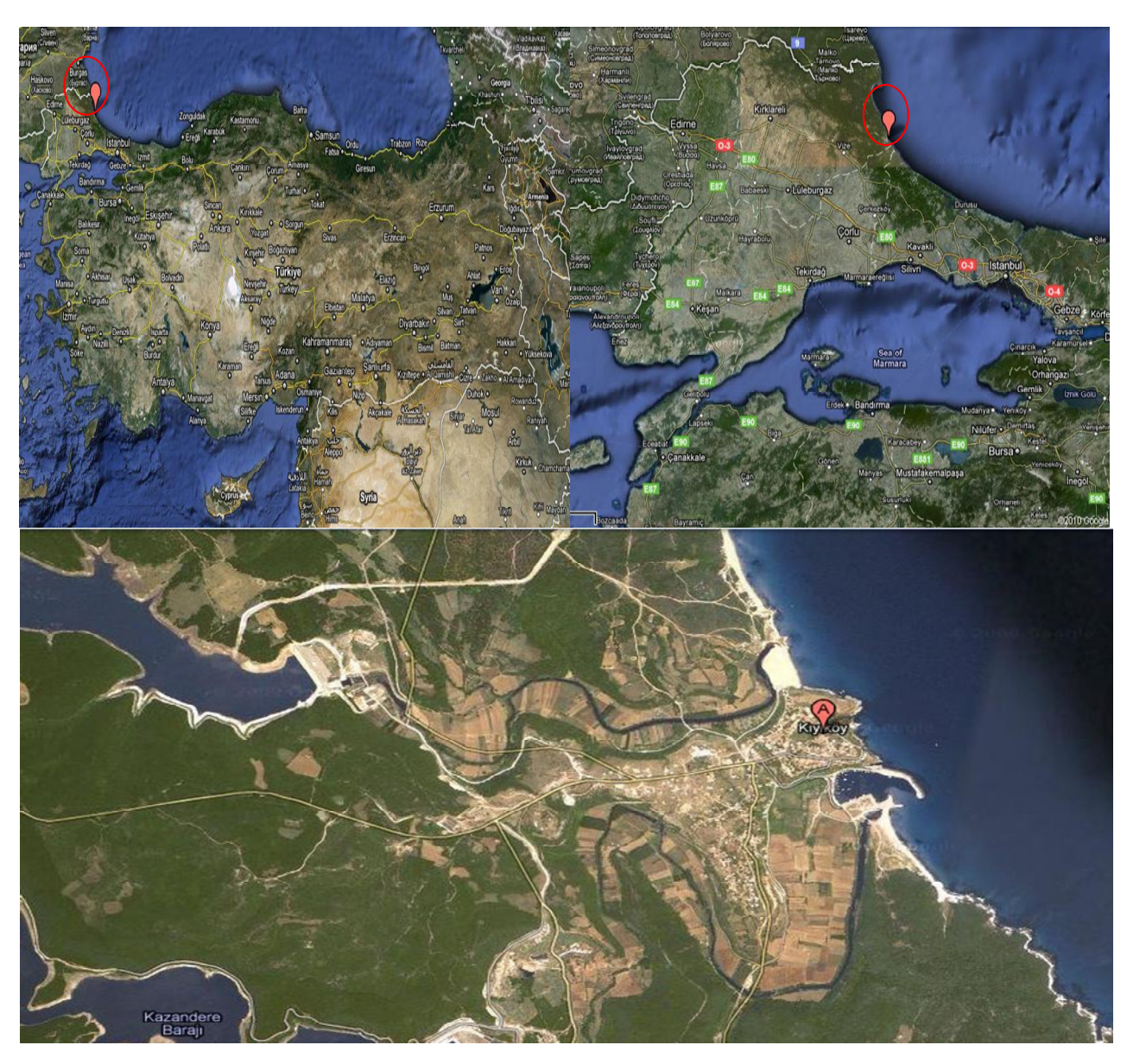
Figure 1. Geographical position of the research area (/earth.google.com/intl/tr).

samples was adopted. In this respect the largest possible sample with constant sampling error has been achieved (May, 1991; Miran, 2007). The sampling formula is given in detail: