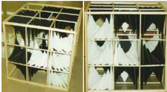
Figure 3. Basic Design Course- 3D Works- repeat of triangles in rhythmic order

Finally, methods of basic design course at Anadolu University are mentioned. The semester begins with line and tone practices; concepts like surface, volume and mass are given correlated with the line. After each concept, memoribility is provided by practices.