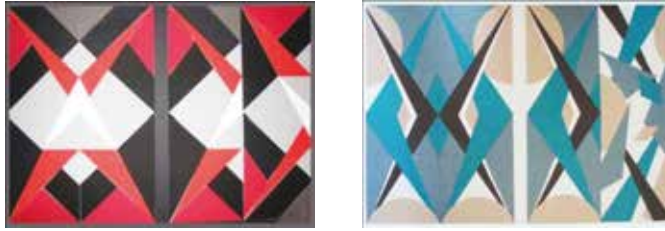
Figure 2. Basic Design Course in Yasar University- 2D Works- symmetric balance, asymmetric balance

The other example will be given from Yasar University. In this studio course, subjects are given to students and expected them to have an observation about the subject before coming to course. After this preliminary work, instructors will give a brief information about the subject and allocate a time for brain storming with students. Therefore, can be provided to have students to think freely without any boundry. After then, it is expected them to work on assignment with the determined datas and restricts of subject. During the semester, students practice on a great amount of assignment. Thus, it is aimed to improve students' rapid and practical thinking, ability of present alternatives.