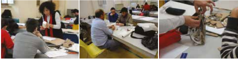
Figure 1. Basic design course, studio critics in University of Camerino, Italy

In addition, basic design course would not be seen as only a pre course for design education, it also aims to give cultural, social, historical and ideological point of view to the students. Basic design studios also aim to integrate the knowledge and skills gained by students through practicing, form a mathematical logic in the problem solving process, connect the student to the outside world more, encourage them to gain making decisions ability, and more importantly develop their designing skills within the framework of designing philosophies and theories (Hacıhasanoğlu, 2003).