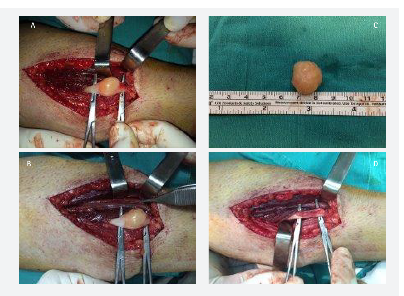
Figure 2. A) Intraoperative view of the lesion showing that the mass at the forearm was originated from the median nerve. B) Intraoperative view of the lesion showing that the mass at the forearm was originated from the median nerve. C) Intraoperative photograph showing dissection of tumour. D) Median nerve after the lesion was removed

anatomical localization of the lesion and its relation to surrounding structures. Also ultrasonography can help to differentiate a solid or cystic nature of the mass.