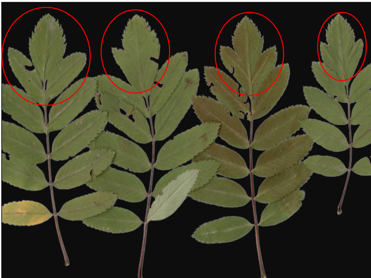
Fig. 3. Morphological variation in terminal leaflets of Sorbus erzincanica .