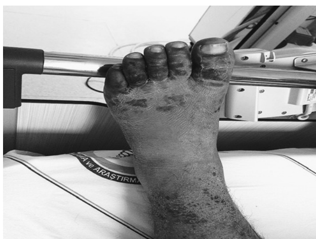
Fig. 1 Erythematous lesions in the healing phase in both lower extremities and gangrenous lesions in the toes

BUN: Blood urea nitrogen; Cr: Creatinine; TP: Total protein; Alb: Albumin; Ca: Calcium; P: Phosphorus; CK: Creatine kinase; Na: Sodium; K: Potassium; UA: Uric acid; WBC: White blood cells; Hb: Hemoglobin; PLT: Platelets; Myg: Myoglobin; CRP: C-reactive protein; PT: Prothrombin time; aPTT: Partial Thromboplastin Time; INR: International Normalized Ratio