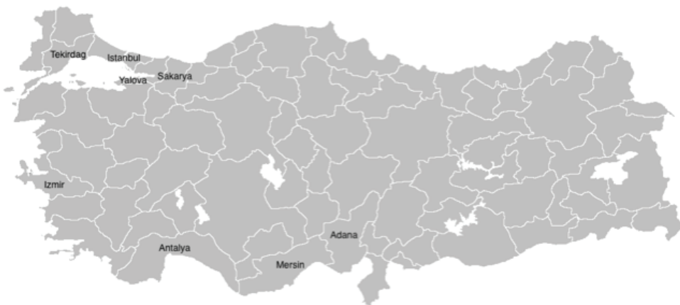
Figure 1. Map of the Turkish provinces where surveys were conducted in the present study

The reference strains of X. hortorum pv. pelargonii GSPB 1955 (provided by Dr. Batur-Michaelis, Göttingen, Germany), X. axonopodis pv. begoniae BPIC