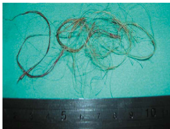
Fig. 4 — Resected hair.

carcinoma. Although no complications were observed in the early postoperative period, a pharyngocutaneous fistula was detected on the 12th postoperative day. Wound care was initiated with daily dressing changes and cleaning with antiseptic solutions. However, after 4 weeks, the patient refused to remain in the hospital. He was discharged and was lost to further follow-up.