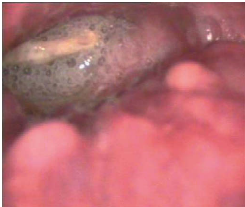
Fig. 1 — Laryngeal endoscopy view of the hairy skin flap surrounded by salivary accumulation in the pharyngostoma region.