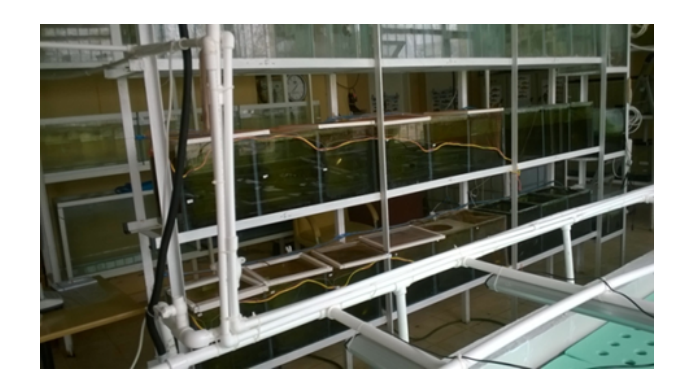
Figure 1. Trial Plan

The research was carried out in the Vocational School of Technical Sciences aquaculture laboratory of Tekirdağ Namık Kemal University ( Figure 1 ).