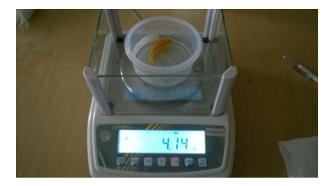
Figure 2. Individual weight measurement

Specific growth rate (\% day^{-1}) = ((lnX_1 - lnX_0) / d) \times 100 (Çelikkale, 1994) formulas are used.