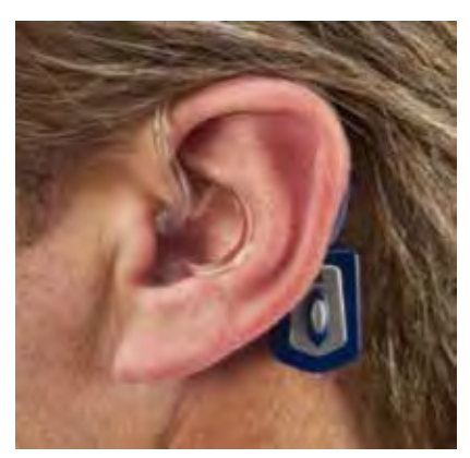
Figure 1. The visual used for the vocabulary item 'hearing impaired'