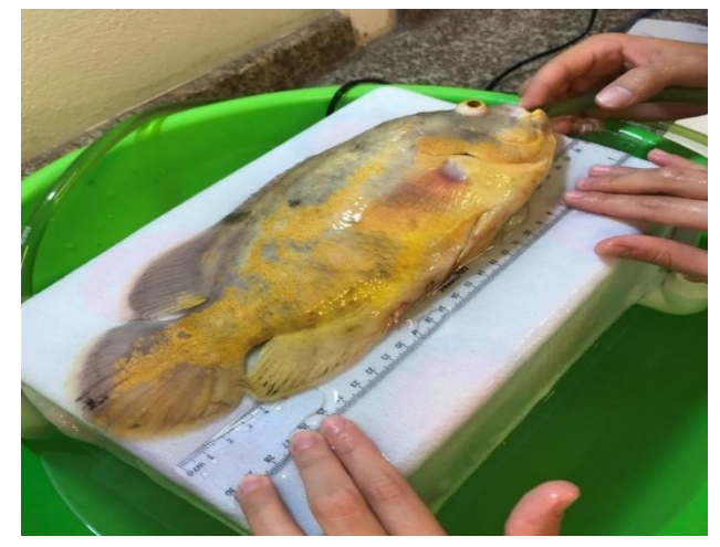
Figure 4. Phenotypic measurements of fish on the anesthetic unit

Fish were weighed with a digital weighing scale g. precise to 0.1 Other phenotypic measurements (total length, fork length, standard length, dorsal fin base length, head length, body depth, eye diameter, pectoral fin length, pelvic fin bottom length, anal fin bottom length) were taken on a flat platform while the fish were under anesthesia. Metric measurements were taken using a ruler on a straight line over the curves of the body (Figure 4).