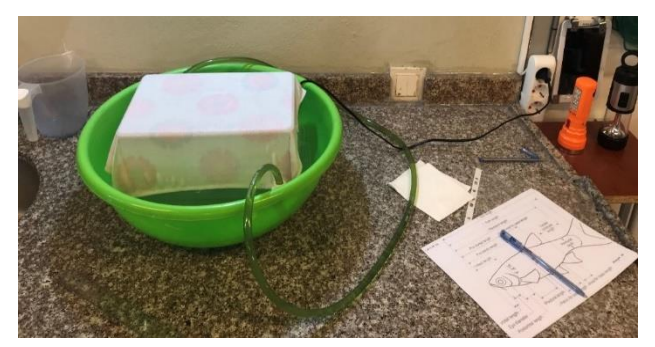
Figure 1. Experimental setup: A simple recirculating system maintains anesthesia by delivering anesthetic water from a reservoir to the gills and recycles the effluent back to the fish through the use of a submersible pump.

Clove oil used in the research was supplied from "Kimbiotek Chemical Substances Joint Stock Company, Turkey". For anesthesia 1.5, 2, 2.5, and 3 cc/L clove oil dosages were tried to determine the optimal dosage in Oscar fish (Figure 1). Each dose was tested at 3-day intervals on the same animals. The solutions were prepared by dissolving clove oil in 95% ethanol (1:10 ratio) as described by Anderson et al [1997] to facilitate mixing.