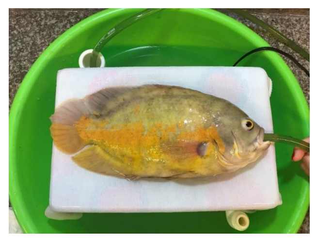
Figure 2. Fish position on a small fish anesthetic unit at the time of anesthesia

The fish was anesthetized and positioned with the lateral side up during measurements (Figure 2). The induction and recovery times of the fish were monitored with a digital stopwatch, and the stimulation reaction was determined by contact with a plastic pipette.