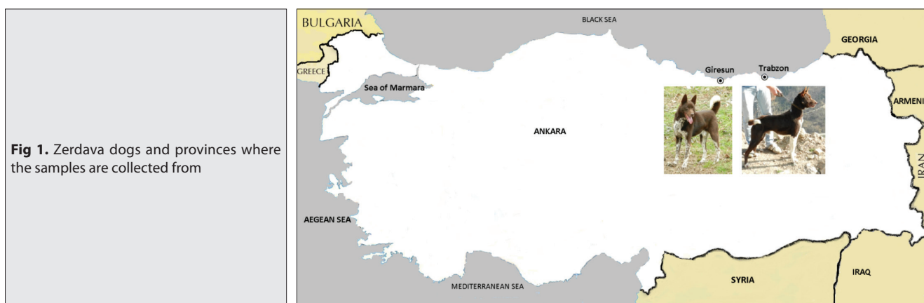
Fig 1. Zerdava dogs and provinces where the samples are collected from

presented in Table 1. The mean live weight values of Zerdava dogs were 16.02 \pm 0.35 kg. The mean withers height, rump height and body length were found to be 48.20 \pm 0.21 , 47.08 \pm 0.24 and 51.24 \pm 0.23 cm, respectively. The mean head length was recorded as 20.95 \pm 0.09 cm, the face length was 8.49 \pm 0.05 and the ear length was 10.04 \pm 0.07 cm. The withers height, rump height, chest depth, chest circumference, live weight, shank circumference, distance between the ears, ear length and mouth circumference were statistically significant depending on age. Moreover, the withers height, rump height, body length, chest depth, chest circumference, shank circumference, head length, face length, ear length, tail length and mouth