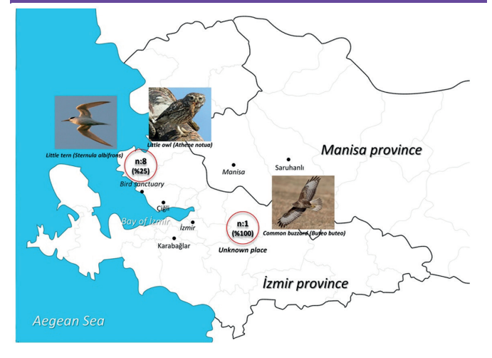
Figure 2. Geographic distribution of N. caninum positive deceased wild birds

Figure 1. Agarose gel image result of PCR positive samples. Lane 1: DNA ladder; Lane 2: Little owl (sample #7); Lane 3: Common buzzard (sample #46); Lane 4: Little tern (sample#48); Lane 5: Positive control; Lane 6: Negative control