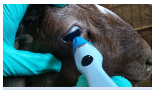
Figure 1. IOP measurement with Tono-Pen Vet<sup>®</sup>.

The animals were divided into 2 equal groups, <1 (6 male, 6 female, n = 12) and \ge 1 (6 male, 6 female, n = 12) years old. IOP measurements were performed twice, in the morning (6:00 a.m.) and in the evening (8:00 p.m.) with an applanation tonometer (Tono-pen Vet<sup>®</sup>, Reichert, U.S.A.).