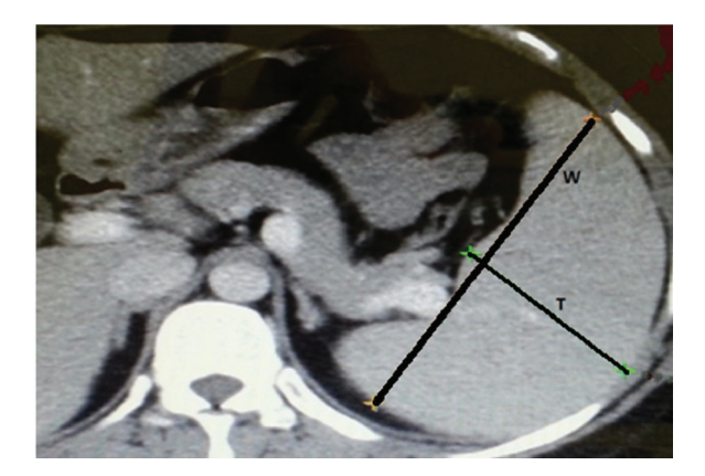
Figure 2. Example of measurement of largest width (W) of spleen, greatest thickness at section where W was determined (T).