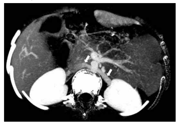
Figure 3. Axial CT image shows a retro-aortic left renal vein (arrows)

In right or left hepatectomy for living donor liver transplantation, the MHV lying in the mid-plane is an important landmark and guide for precise liver transection (6). The surgical plane courses 1 cm to the right of the MHV in cases of right lobe dissection. In the right liver graft donor operation including the MHV, the MHV has to be exposed and followed in the transection plane so that minimal necrotic tissue is left on the graft surface. For the left liver graft donor operation, the MHV is followed so that the transection will not approach and damage the right anterior portal pedicle (7). Knowledge of vascular anatomy and variations therein helps avoid undue damage to the transplanted and remnant liver. Important hepatic venous variations affecting both donors and recipients are seen in some patients, thus posing a challenge for the surgeon, and may result in a modification of the hepatectomy plane (8).