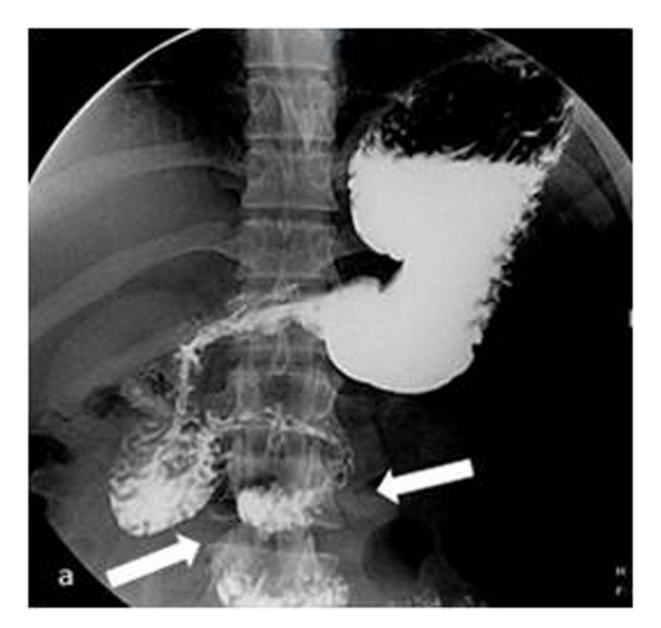
Figure 3 The typical corkscrew appearance as seen at the barium series. This appearance is created by the duodenum and the proximal jejunum.

It has been reported that CDUS is a valuable tool in the diagnosis of midgut volvulus. The intestinal segments and dilated SMV