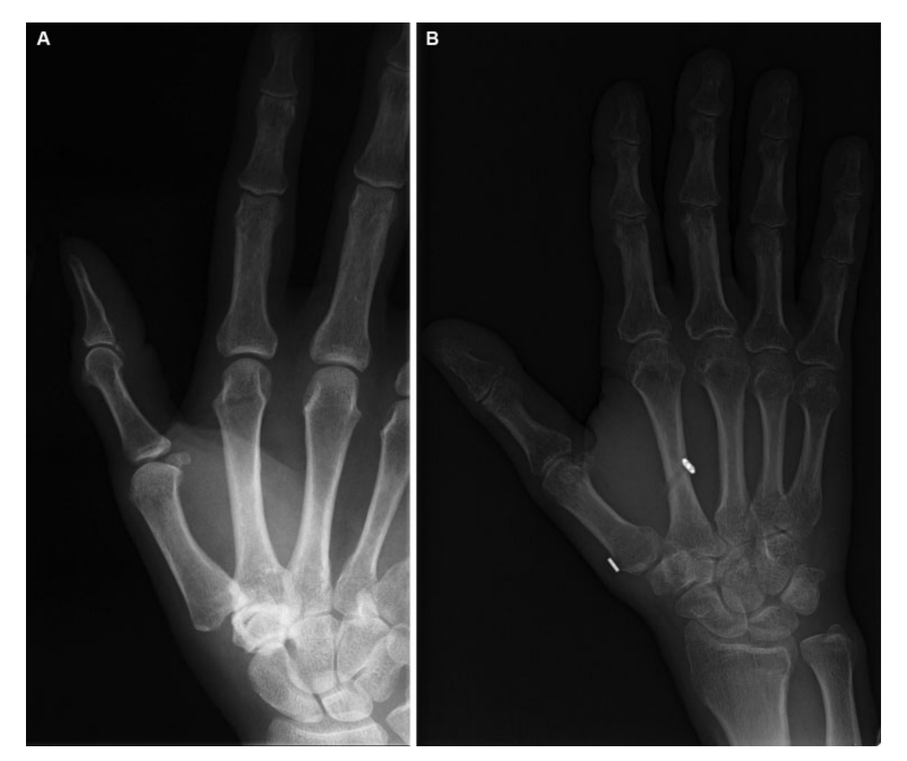
Fig. 3 (A) Preoperative radiographs of a 47-year-old man with a first CMC Eaton–Littler stage 2 arthrosis. (B) Postoperative day 1 radiographs of the same patient with first CMC Eaton–Littler stage 2 arthrosis treated by arthroscopic hemitrapeziectomy and suture button suspension plasty. CMC, carpometacarpal.

the suture were pushed into the intermetacarpal space which was covered with interosseous muscles. The skin incisions were sutured by a rapid vicryl and a cast was not applied. The rehabilitation was started on the 2nd postoperative day and the patients were admitted to use their operated hands after the pain relief. The patients were allowed to do pinching and grip exercises as much as they could tolerate pain in the postoperative 2nd day. We did not apply a splint to our patients during postoperative period. Please refer to online version for - Videos 1,2, 3 .