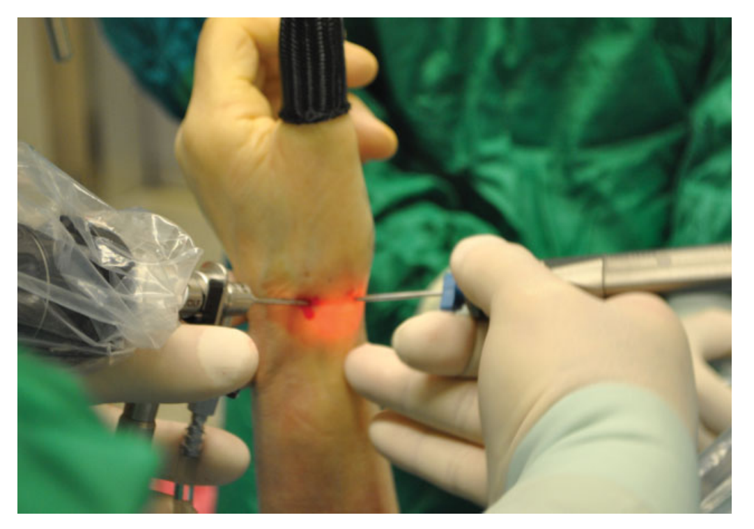
Fig. 1 The arthroscopic evaluation of the CMC joint by using a 1.9 mm optical camera. CMC, carpometacarpal.

hook of the special K-wire which is thicker at the proximal two-thirds. Then one of the suture buttons was placed in the tenar area, under the muscles to prevent the button from being felt under the skin. To decide the tension for suture button arthroplasty, after terminating the thumb traction without removing the Chinese finger trap from the thumb, the thumb was positioned by an assistant in suffi-