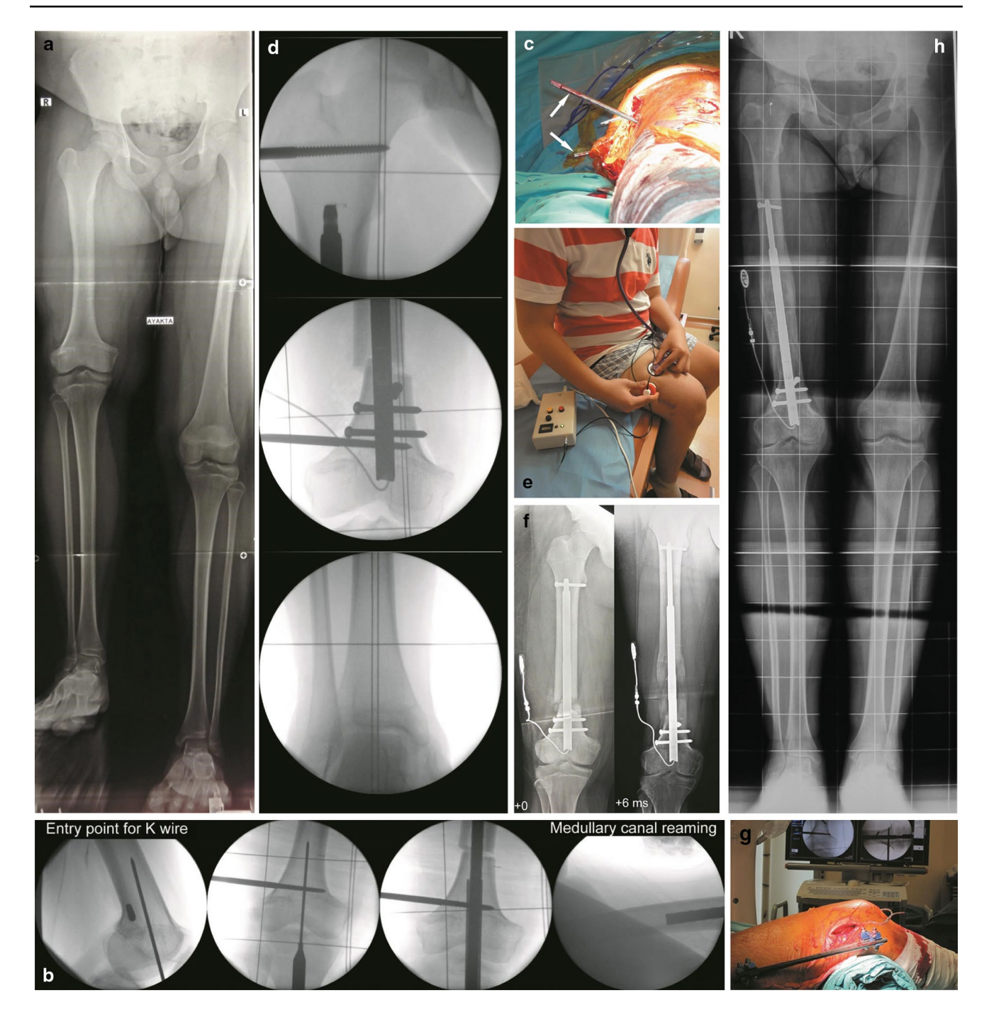
Fig. 1 A 14-year-old male with 14 cm of femoral shortening, 6^{\circ} varus, and 30^{\circ} rotational deformity was treated with two consecutive retrograde Fitbone applications. a) Preoperative LSR while the leg length differences were compensated for using plates and the patellae were oriented anteriorly. b) The standard entry point of the K-wire for retrograde femoral nailing and medullary canal reaming was used with rigid reamers. The K-wire should be placed exactly as in the preoperative plan for accurate deformity correction. c) A 30^{\circ} acute rotational correction was completed before reaming the proxi-

mal medullary canal. d) Position of the blocking screw and intraoperative alignment control using a grid plate (see the text). e) Distraction using activation of the transmitter head and the control electronics. f) The x-rays in the early postoperative period and 6 months after 8 cm of distraction. g) The Fitbone was replaced with a new one after the first distraction period, and the femur was distracted a further 6 cm. A temporary external fixator was used intraoperatively to protect the distraction site. h) LSR after 14 cm of lengthening and deformity correction