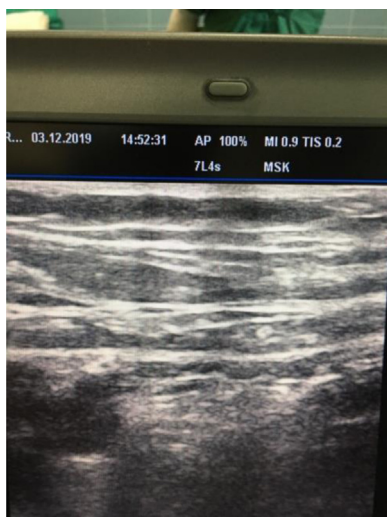
Figure 2 US image taken during the TAP block procedure.

lateral inguinal hernia repair were included in the study. A total of 80 patients who fulfilled the inclusion criteria of our study were randomized into two groups. The inclusion procedure is shown in Figure 1.