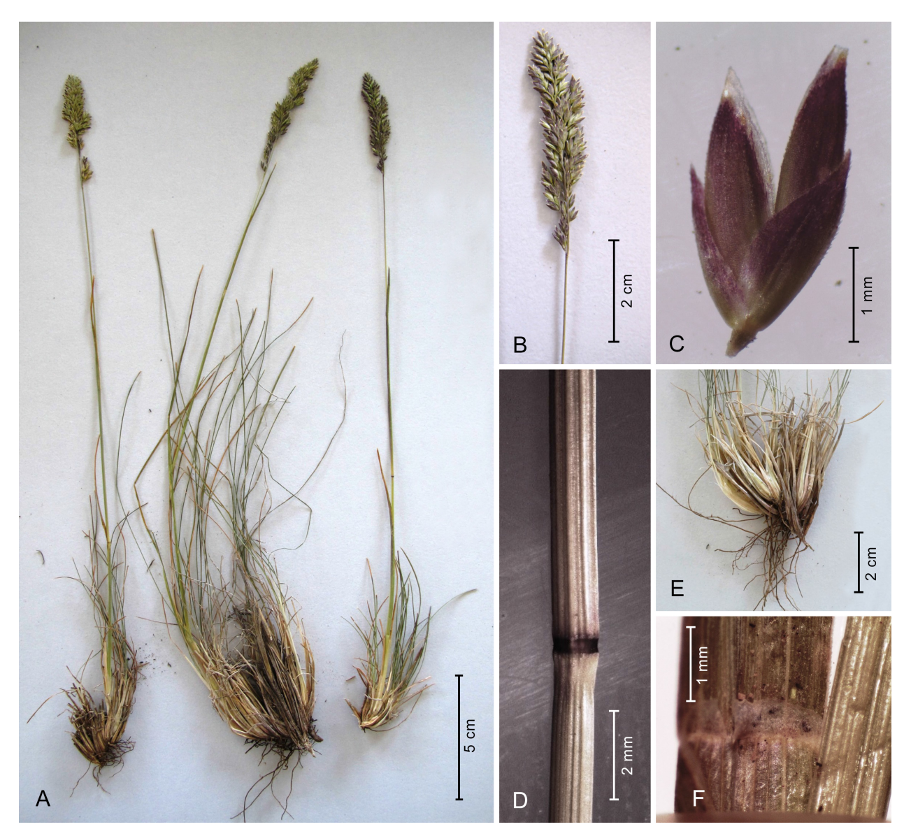
Fig. 2. Poa densa (E. Cabi 5135) – A: habit; B: inflorescence; C: spikelet; D: culm upper node; E: basal bulbous shoots; F: ligule.

1816, nec Blytt 1861]. – Lectotype (designated here): Georgia, Tbilisi region, Gargjiiskaya steppe, 17 Jun 1927, N. Troitsky (LE [photo at E!: E00326518]).