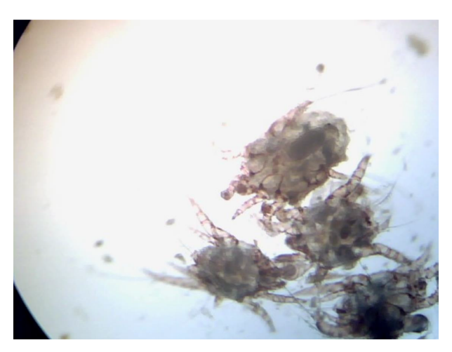
Figure 1. Adult O. cynotis mites and female with a visible egg.

on severity (0: absent, 1: mild, 2: moderate, and 3: severe) as reported previously (22–24).