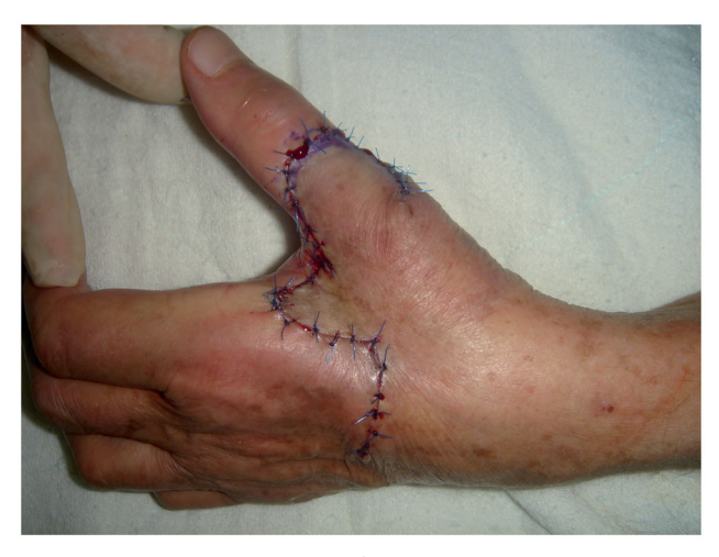
Figure 2. Postoperative view of reconstruction.

primary objectives of hand reconstruction procedures [2]. The bilobed flap is a double transposition flap commonly used in reconstruction of areas where skin