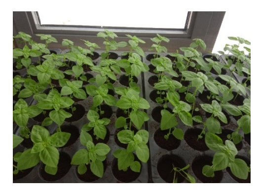
Figure 1. An image of Ocimum basilicum during the germination

In this study, the correlation of some micro and macro nutrient elements of whole aboveground parts of the basil plants ( Ocimum basilicum ) grown in laboratory conditions with its antibacterial effect on four different bacteria was investigated. An image of the growth of basil plants in viols belonging to this study can be seen in Figure 1. Whole plants were dried and grinded properly, and some micro and macro nutrient elemental contents were determined with ICP-OES. The amounts of the micro and macro elements determined in basil plants used in this study is given in Table 1.