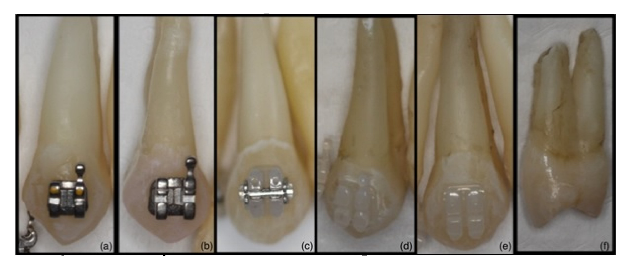
Figure 1. ( a ): Victory metal (Group 1); ( b ): Gemini metal (Group 2); ( c ): Clarity self-ligating ceramic (Group 3); ( d ): APC Clarity Advanced ceramic (Group 4); ( e ): Clarity Advanced ceramic (Group 5); ( f ): Control (Group 6).