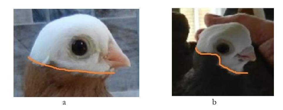
Figure 4: Baska pigeon a: Straight mark line, b: Camber mark line.