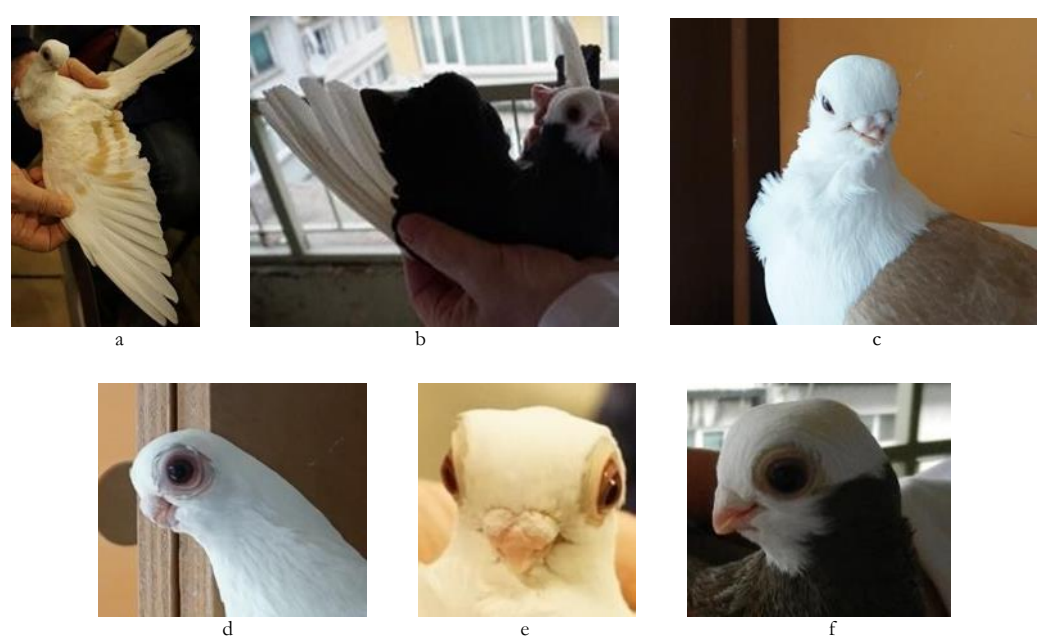
Figure 1: a, b: The appearance of white feathers on the wings of Mısıri and Baska pigeons, c: Frill structure on chest in Mısıri pigeon, d, e and f: Eye cere and nasal cere in Bango, Mısıri and Baska pigeons, respectively.

Chickpea*: Plumage colour is <u>blue</u> and tip of wing primaries are covered with light gray bars Lemon-yellow**: Feather colour is light yellow and tip of wing primaries are covered with dark