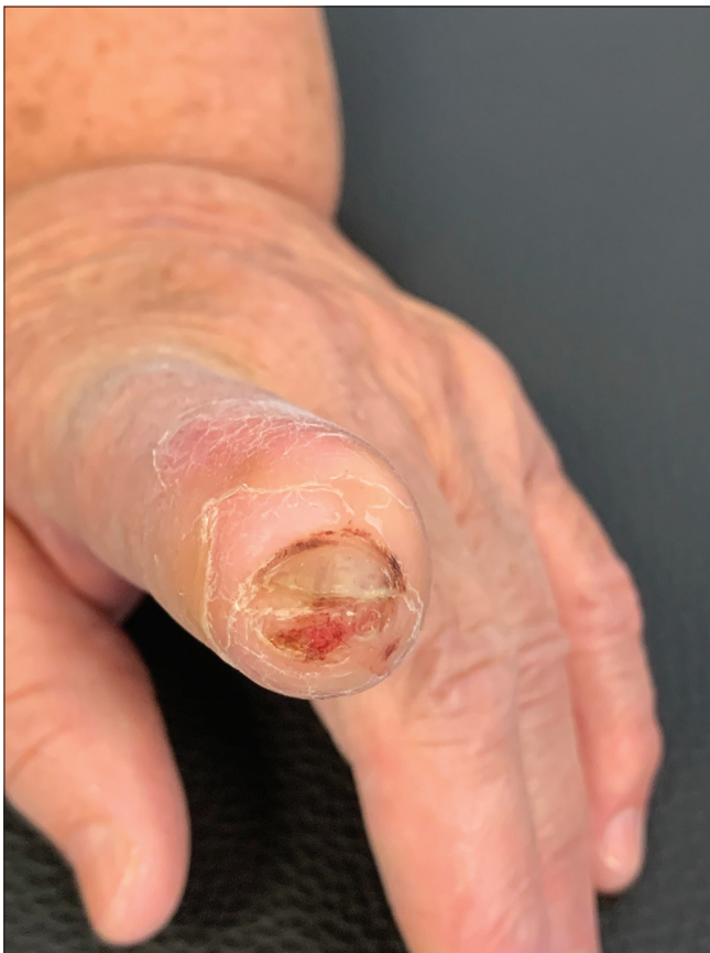
Figure 1: Skin ulceration, shortening, and swelling on the second distal phalanx of the left hand

A 69-year-old female nonsmoker presented with a painless skin ulcer on the second left finger for 2 weeks and swelling of the same digit for 6 years duration. She had no symptoms of Raynaud phenomenon and no history of systemic illness, exposure to chemicals, or trauma. There was no family history of AO. Dermatological examination revealed superficial ulceration on the tip of the second distal phalanx of the left hand, Heberden's nodes, and shortening and swelling of the same digit [Figure 1]. Radial, brachial, and ulnar pulses were normal with cold peripheries. Joint contracture or systemic sclerosis-like skin changes were not detected. The patient did not have any thickened peripheral nerve trunk or tenderness. She had no classic skin lesions of leprosy. The patient's thermal and touch sensations were normal, yet she had a loss of