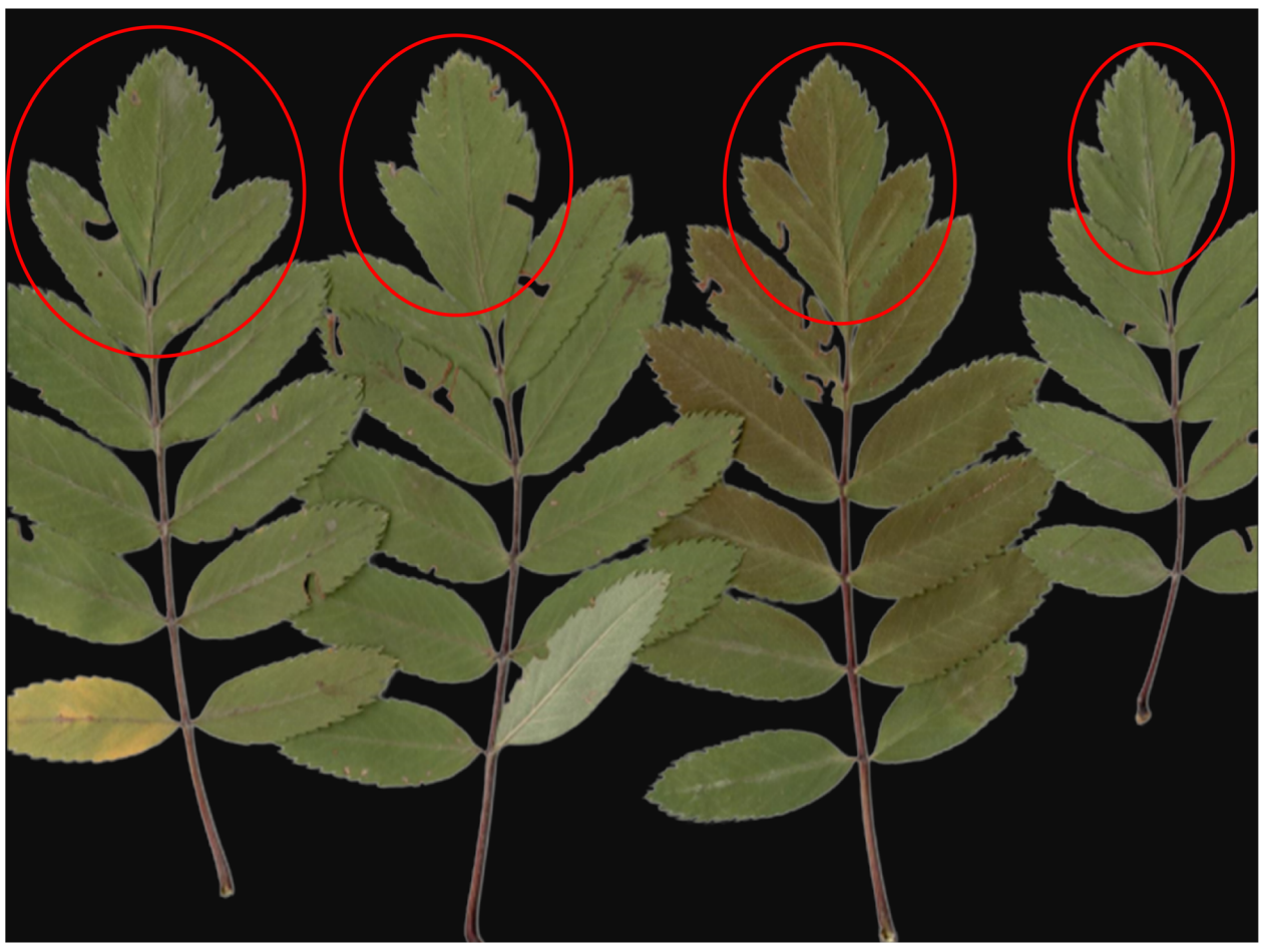
Fig. 3. Morphological variation in terminal leaflets of Sorbus erzincanica.