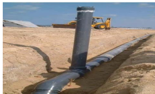
Figure 1. Elements of the vacuum Figure 2. Vacuum sewage lines in a sewage system single trench