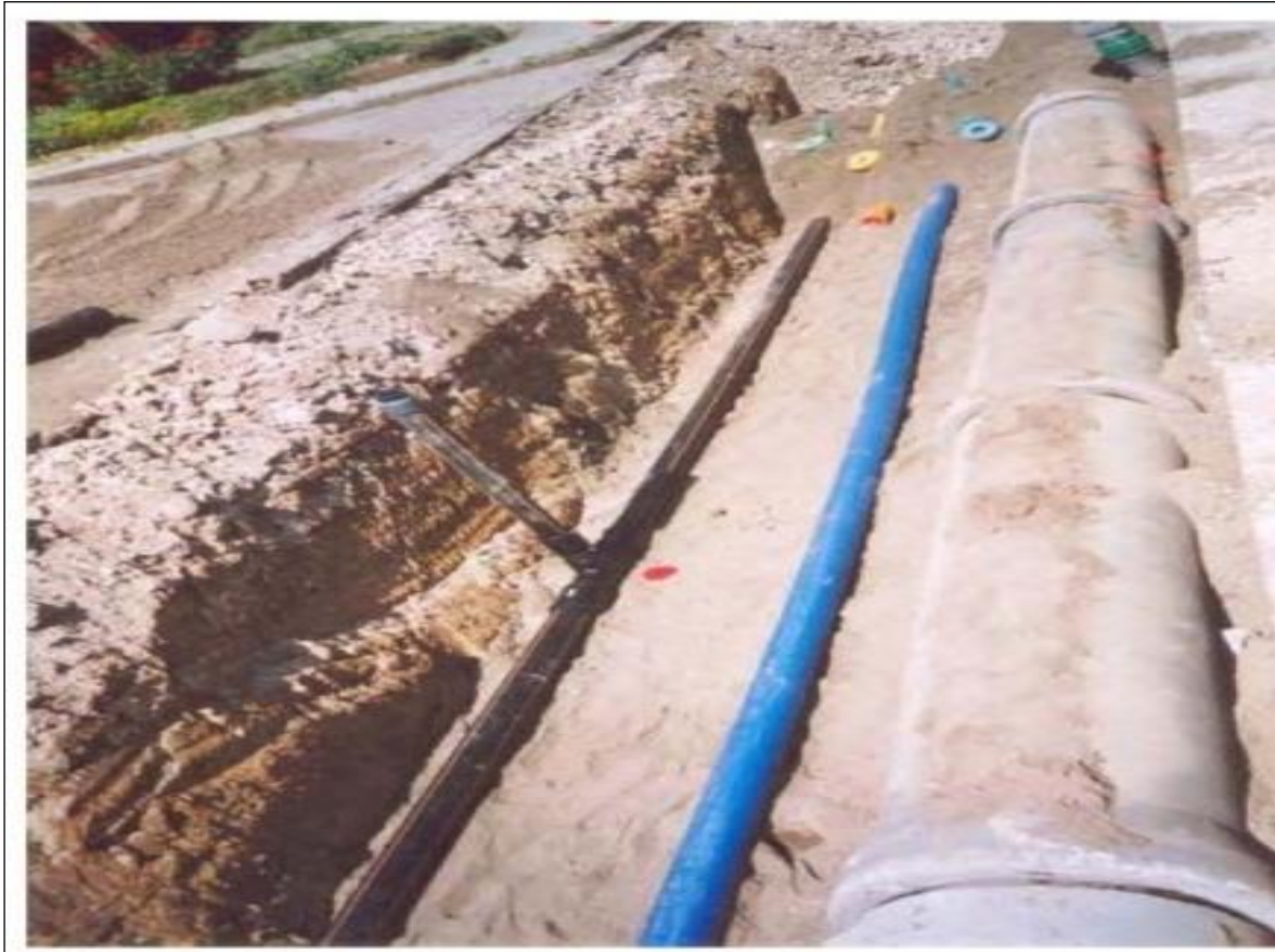
Figure 3. The Clean water and sewage pipes

Clean water and sewage pipes : Clean water pipes and irrigation pipes could be built through vacuum sewage lines in a single trench.